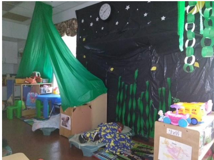
Centers include a campsite for dramatic play.